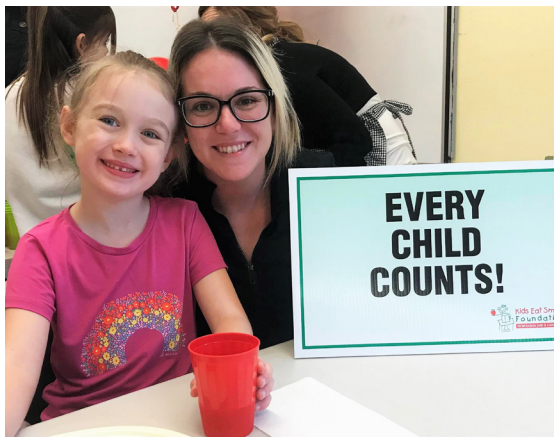
Southwest Arm Academy, Little Heart's Ease, serves breakfast 5 days a week to 70 children.