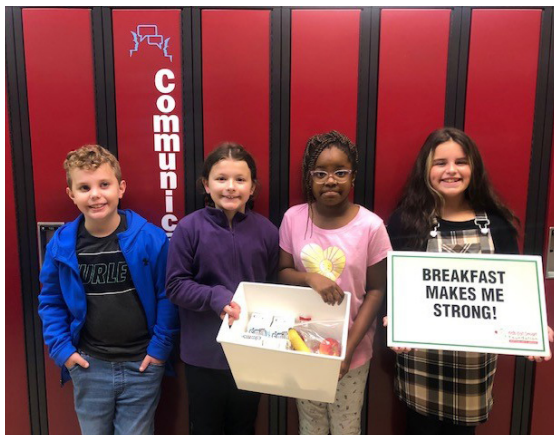
Sprucewood Academy, Grand Falls-Windsor, serves breakfast 5 days a week to 300 children.