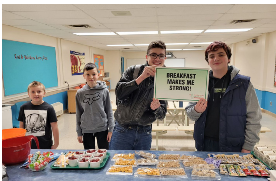
St. James All Grade, Lark Harbour, serves breakfast 5 days a week to 105 children.