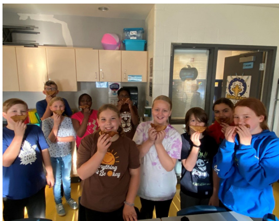
Elizabeth Park Elementary, Paradise, serves breakfast 3 days per week to 490 children.