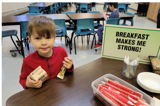
Gros Morne Academy, Rocky Harbour, serves breakfast 5 days a week to 60 children.