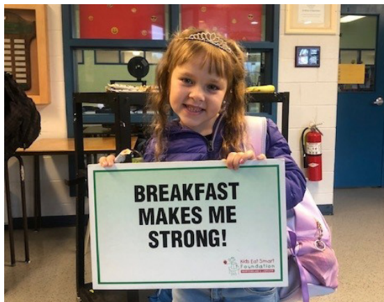
Riverwood Academy, Wing's Point, serves breakfast 5 days a week to 150 children.