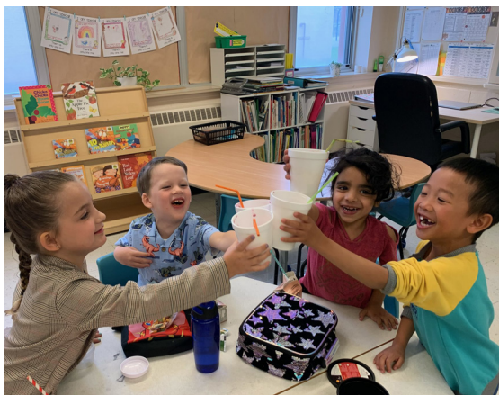
Bishop Abraham Elementary, St. John's, serves breakfast 5 days a week to 130 children.