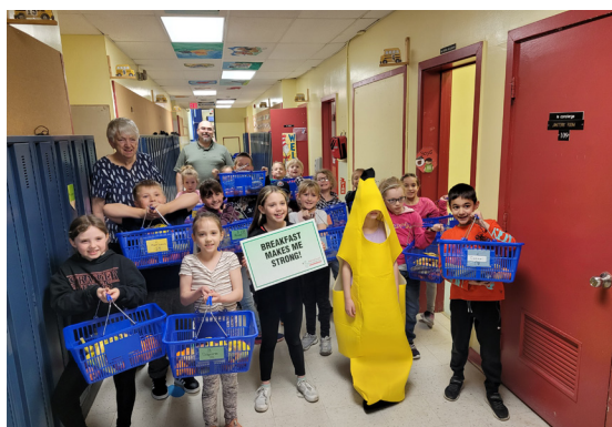
Peacock Primary, Happy Valley-Goose Bay, serves breakfast 5 days a week to 70 children.