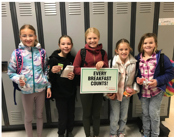
Amalgamated Academy, Bay Roberts, serves breakfast 5 days a week to 250 children.