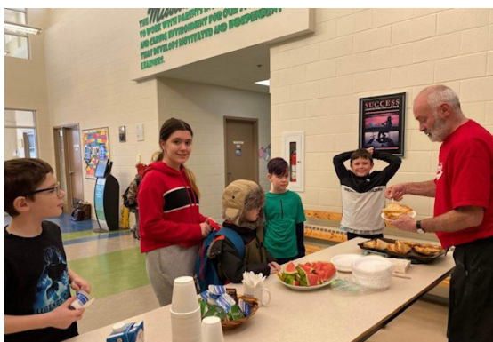
Bayside Academy, Port Hope Simpson, serves breakfast 5 days a week to 50 children.